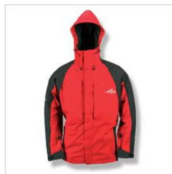
Full-featured Shell Jacket

Shell layer garments are available in various designs and fabric weights offering different levels of protection. Currently the market is flooded with ultra light weight shell garments of which many perform as well, or even better, than the older style heavy weight shell systems. Usually the expected life span of a heavier weight garment is significantly longer than the light weight one's and they often offer a higher level of protection. Once again you will have to make your choice depending on your activities and use.