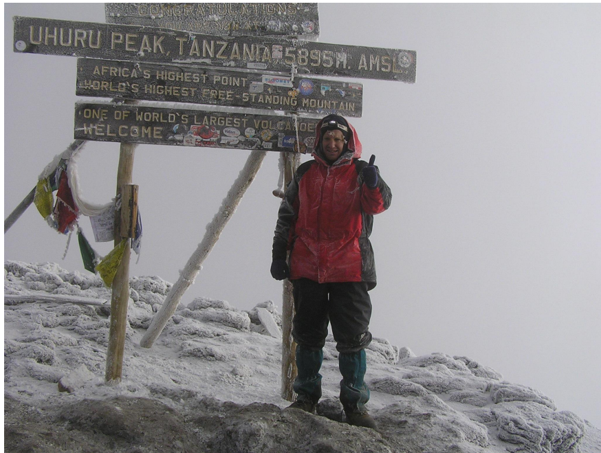
Well layered up against the cold on the Roof of Africa