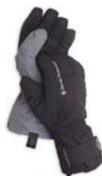
Insulated Shell Gloves