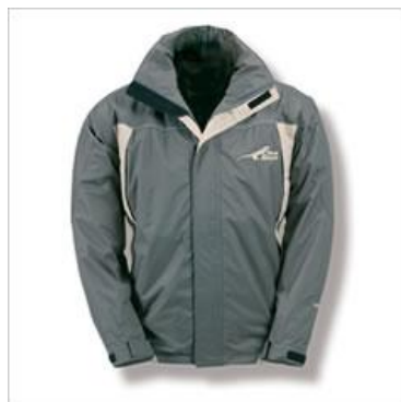
Light weight Shell Jacket

Shell pants should have full or half leg length zips for easy on and off over heavy footwear; a built-in gaiter on the legs and either proper hand pockets or access to the pockets of your Mid Layer pants.