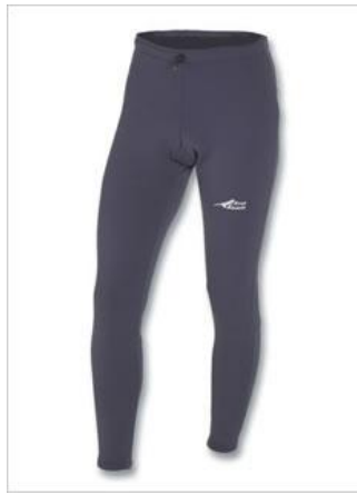
Expedition weight Long Johns