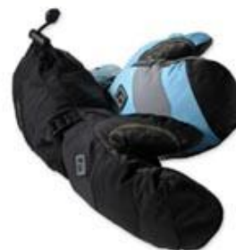
Insulated Shell Mitts

Modern trekking and hiking boots generally don't require a double sock system for preventing blisters when fitted correctly. Heavy mountain boots, however, may be more comfortable worn with a thin, wicking liner sock and heavier insulating outer sock. For very cold conditions it may be advisable to wear a double pair in thick insulating socks. Always remember to fit your boots with the socks you intend to wear and the expected conditions in mind.