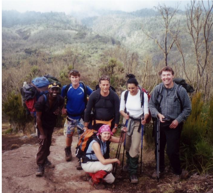
Layering with wicking T-Shirts and Nylon Trekking Shirts & Pants on the lower slopes of Kilimanjaro